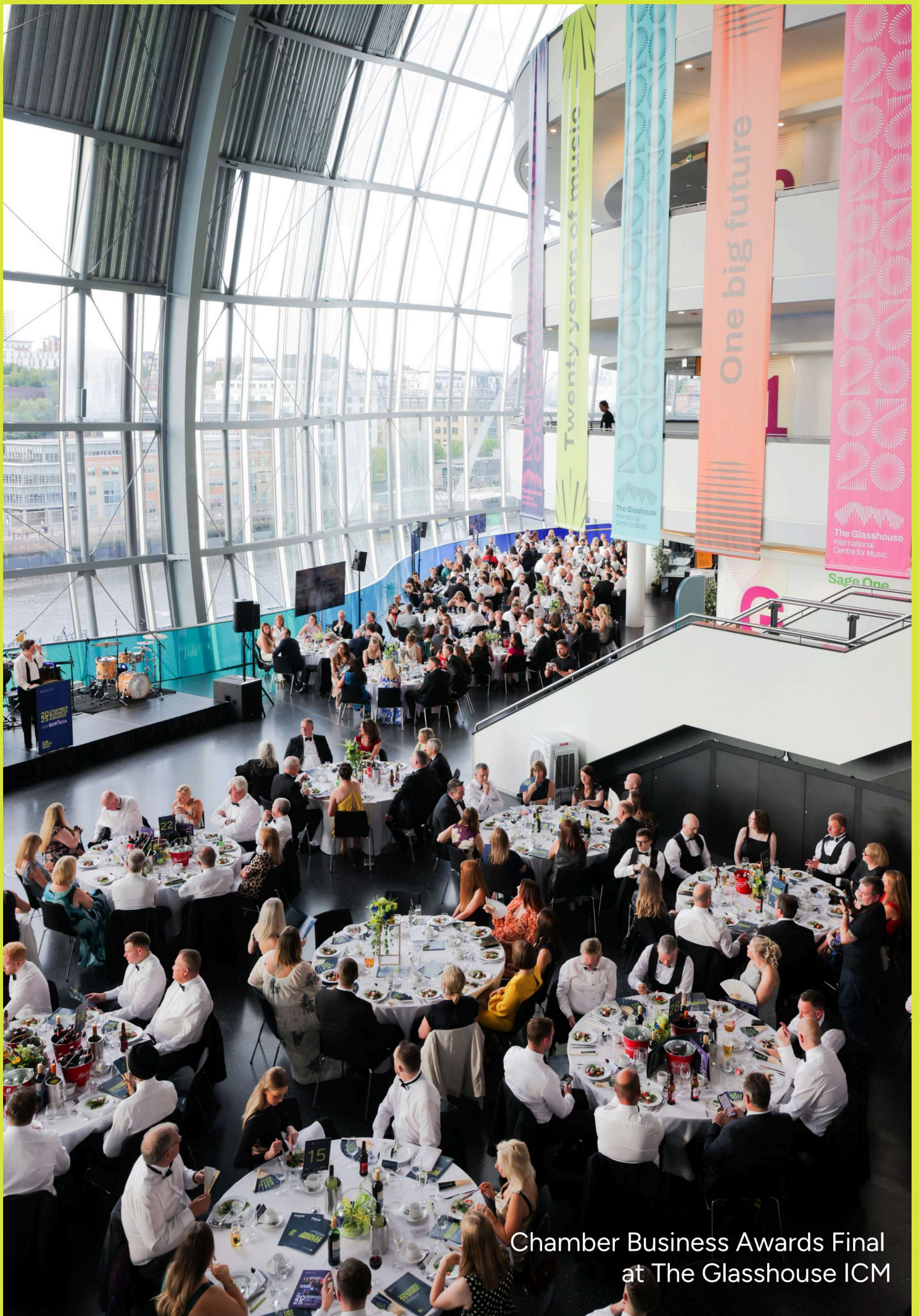
Chamber Business Awards Final at The Glasshouse ICM