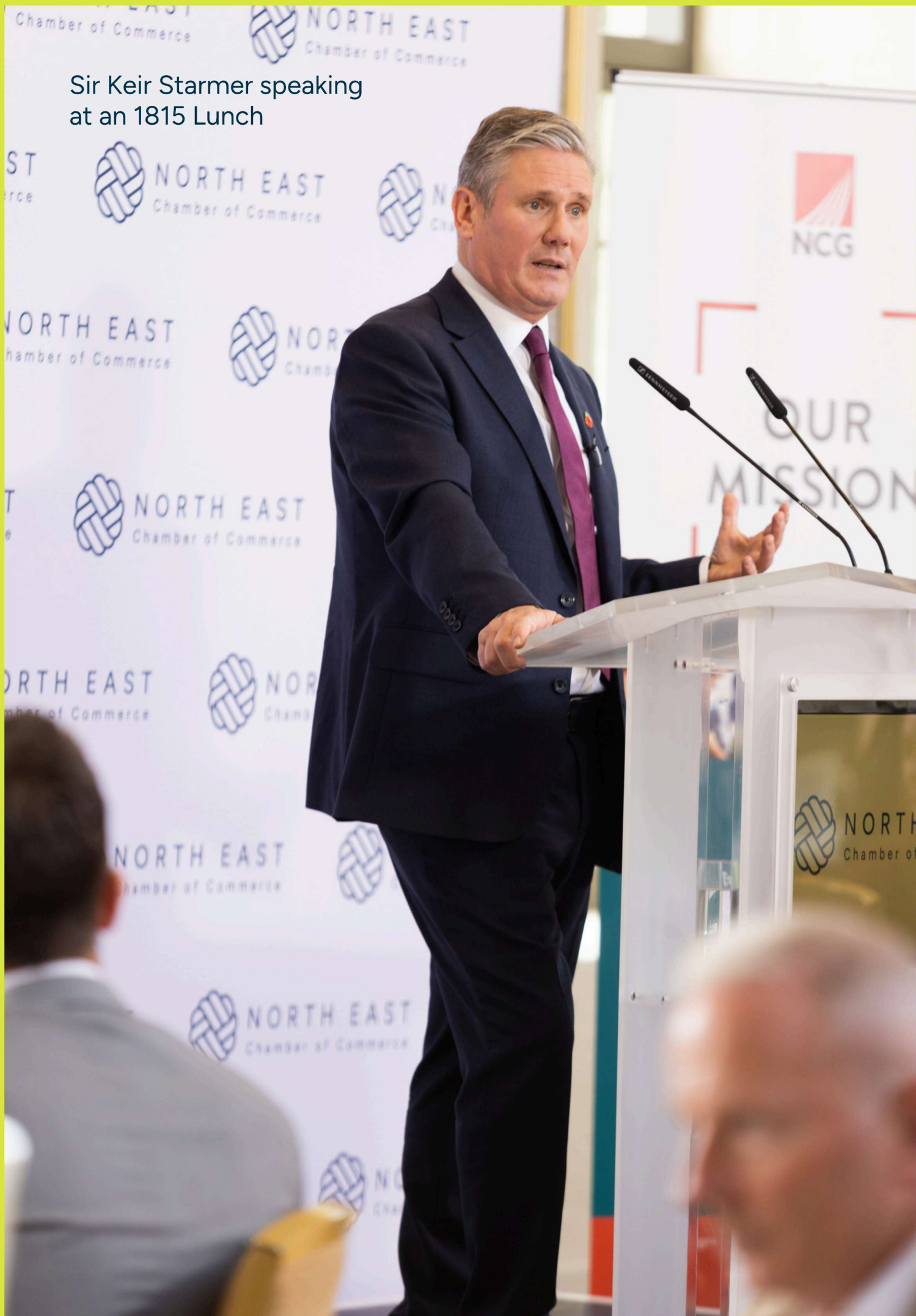
Sir Keir Starmer speaking at an 1815 Lunch